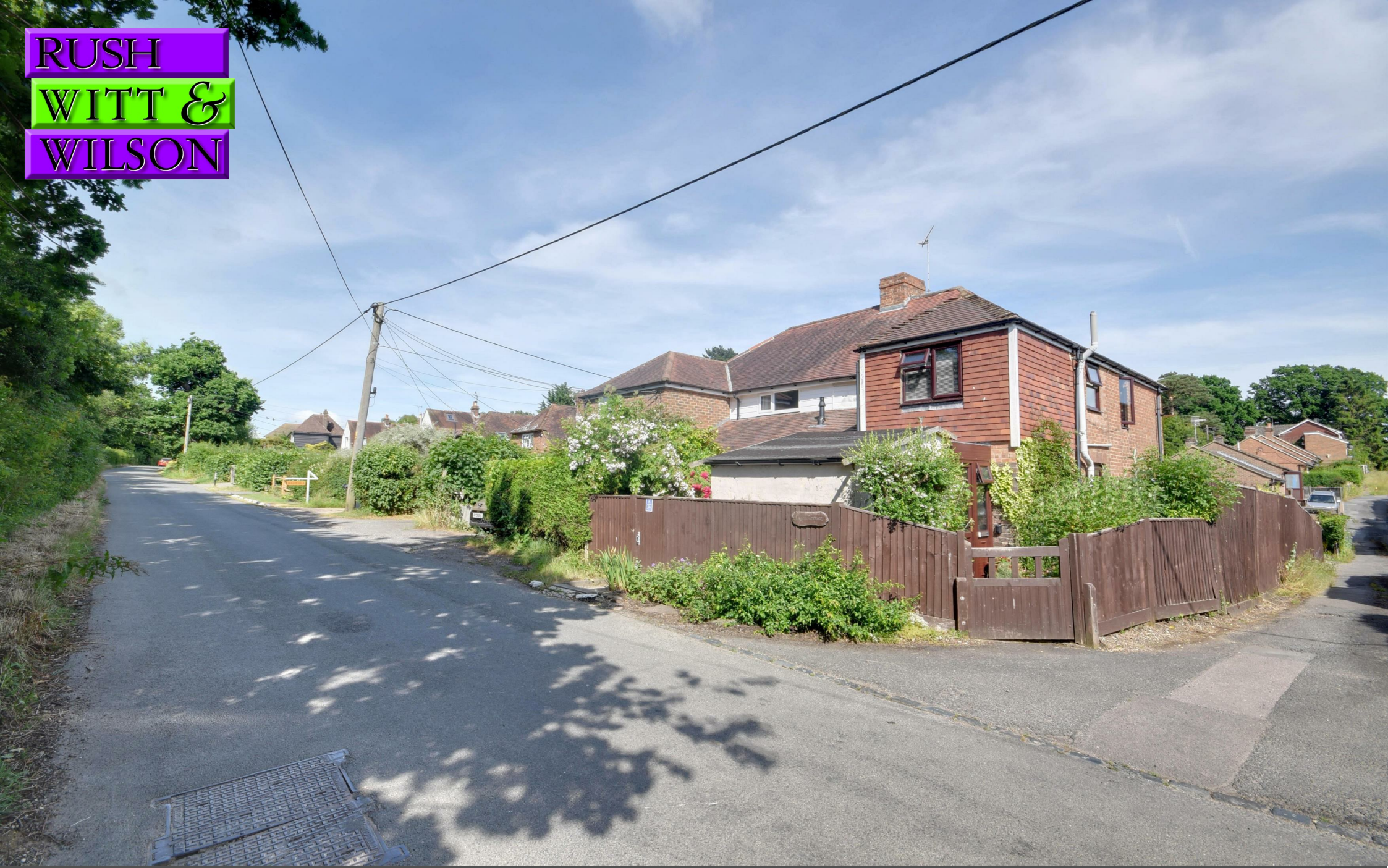
Craven Cottage, Ewhurst Lane, Northiam, East Sussex, TN31 6PA. £425,000 Freehold